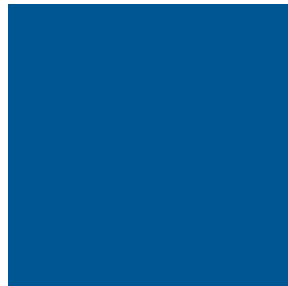
Blue C=100 M=53 Y=2 K=25