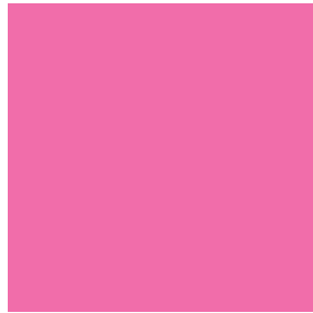
Pink C=0 M=72 Y=0 K=0