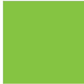
Green C=53 M=0 Y=99 K=0